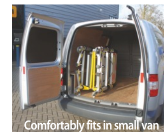
Comfortably fits in small van