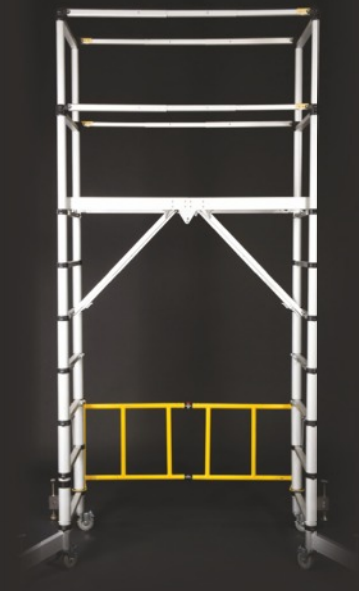
Fully erect Platform 2.00m

Without wheels: Height 83cms. Width 81cms. Depth 42cms.